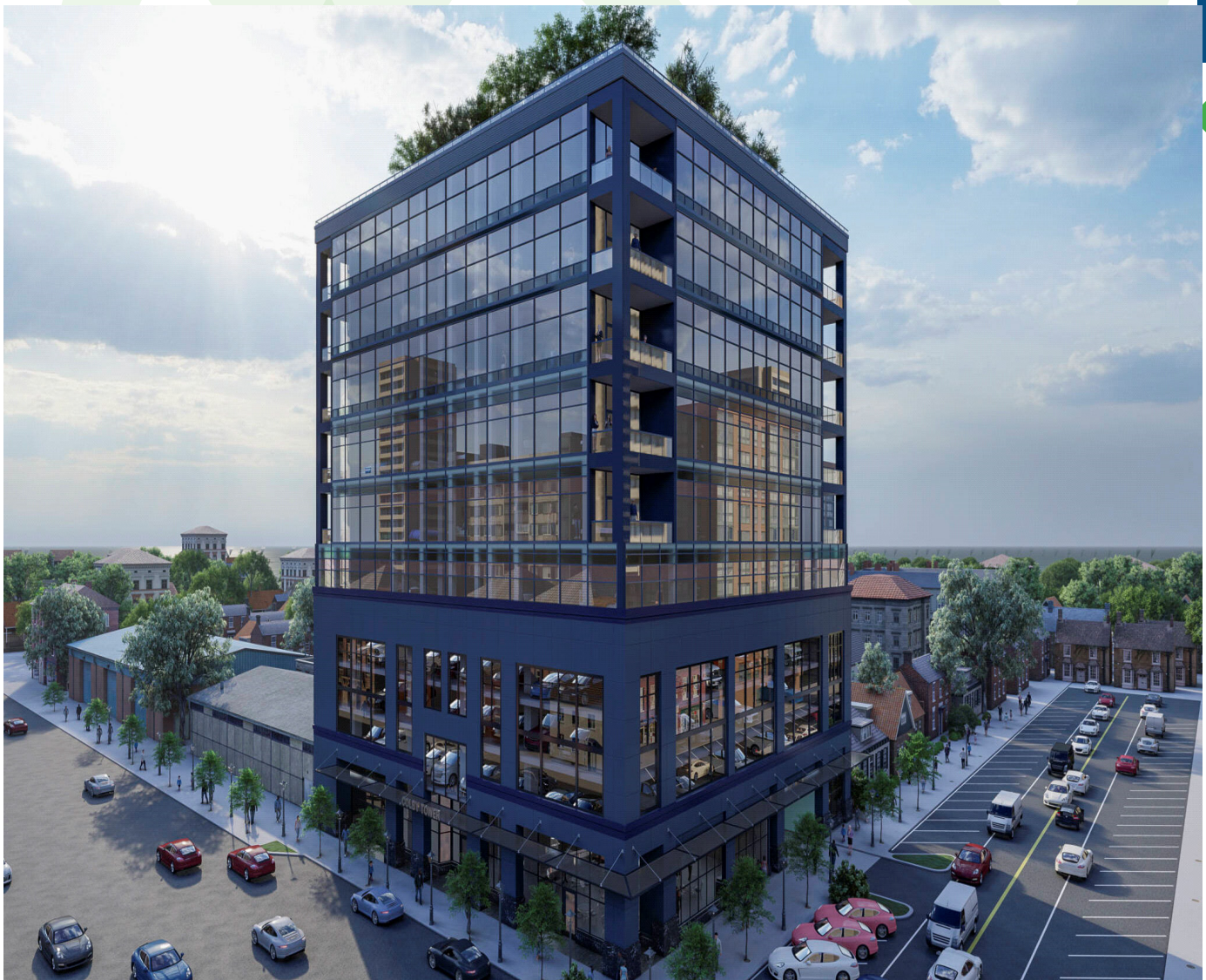
Digital rendering of Colby Tower